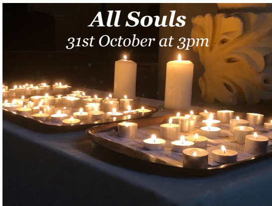
All Souls 31st October at 3pm

Derry Hill - Tue-Sat 9am to 4pm, Sundays 12-4pm