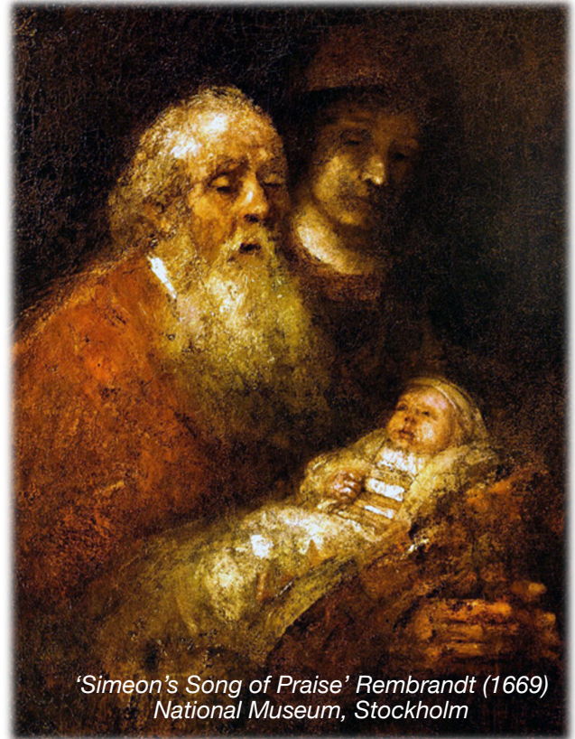
'Simeon's Song of Praise' Rembrandt (1669) National Museum, Stockholm

When they had finished everything required by the law of the Lord, they returned to Galilee, to their own town of Nazareth. The child grew and became strong, filled with wisdom; and the favour of God was upon him.